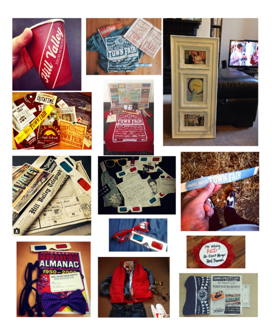
Figure 2 – Audience/player generated content accumulated both in the lead-up to the event and during the experience

This will be familiar as a structure for creating multiple narratives within one setting to any player who has previously taken part in video-RPG sandbox games or even board-game or live-action variations not based on film text or setting. A notable similarity is the availability of the option for the player to ignore all the quests and even the exploration potential and do something arbitrary or 'normal' in the spaces of the map which weren't reserved for the quest such as sit in a bar and drink. If the player chose this option at the BttF event, instantly the experience would lose most of its 'game' elements and simply become more similar to a themed festival or a costume party. In this same vein, fairground rides featured, demonstrating the curious mixture of immersive action and non-specific revelry, or to deploy the Caillois system of categorisation of play – mimicry (playing a role) and ilinx (the thrills of the fair ground). Along with navigation, acquisition is a key part of many game modes, especially RPGs, whether you're collecting coins, bottle-caps or medi-kits, and within the Hill Valley site there were a lot of mechanisms through which this could be achieved, not only by way of the quests as mentioned above. A dress shop which sold fifty-dollar dresses and a record shop selling five dollar albums were key indicators of the organisers' desire to use the experience not only to sell tickets but to sell merchandise (see Figure 2).