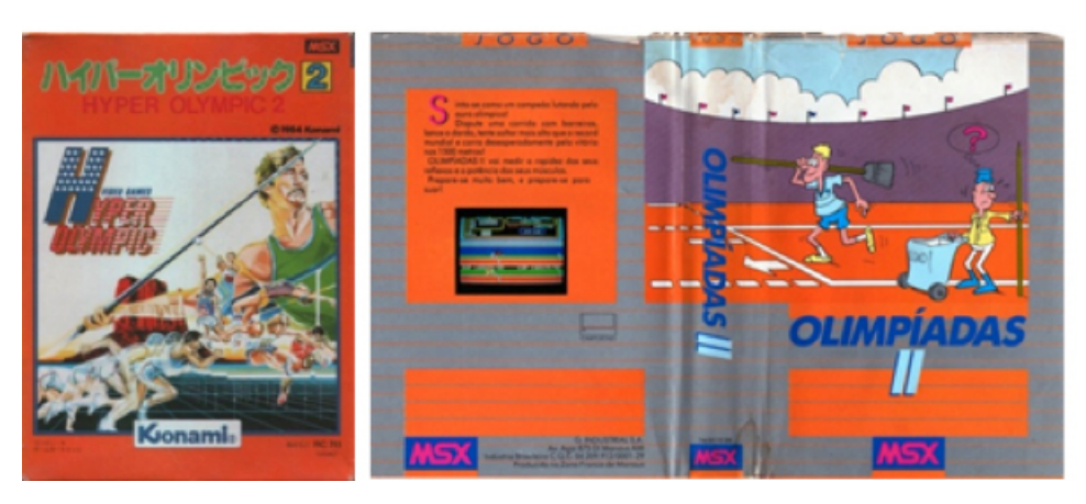
Figure 2 – Boxes of the game Hyper Olympic 2: on the left, original Konami. On the right, Gradient's clone.

Knightmare Gold is a tribute to the 1986 Konami game Knightmare (Majou Densetsu, in Japanese), one of the most acclaimed MSX games ever. Knightmare Gold has graphics that are very similar to the original game, but comes with a remastered CD quality soundtrack.