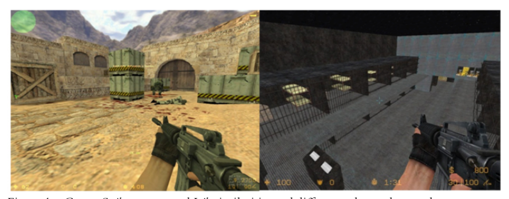
Figure 1 – CounterStrike: source and Jail: similarities and differences beyond gameplay

For mod, abbreviation for modification, we consider any alteration made in any game element. There are several communities in which modders – the individuals who make mods – build their own subculture, with their specific groups who develop and share their mods to other players.