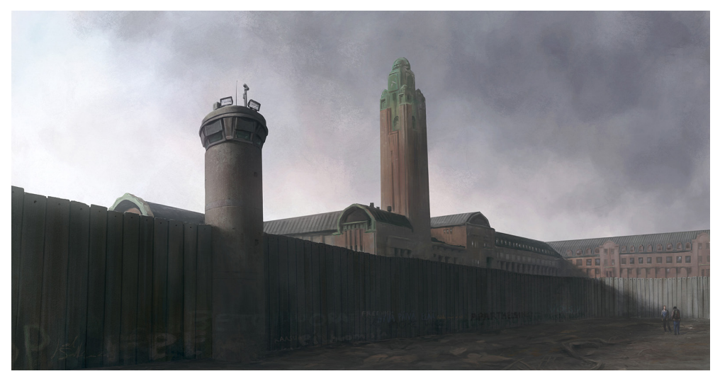
Figure 4 – The oppressor's camp in front of Helsinki's main railway station. Screenshot from the visual material for Piiritystila – State of Siege – Halht Hisar. Montage by Joel Sammallahti, 2013

For Nordic Larp it is the Scandinavian region, Finland and Iceland, that is mistaken as an essential ingredient of Nordic Style larping. It would however be impossible to point out what difference it makes whether a larp is staged in Bavaria or in Turku, in Minnesota or in Peru. It also makes no difference whether the larpers themselves are proper Finns or Swedes or if they stem from another part of the world. There is a larp tourism nowadays that mixes and merges participants. There are also Nordic Larps in Palestine as one can read on nordiclarp.org<sup>12</sup> and the question must be posed whether we have Nordic Larp in Palestine there, or Palestinian Larp by Nordic players here. However one might turn it, it seems to make no sense to identify a subculture by the territory the founding fathers have been roaming in.