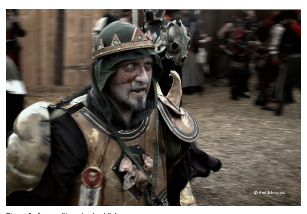
Figure 2 - Larper.

"The simulationists and the eläytyjists have nothing to lose but their chains. But they have the whole world to win. TURKUIST ROLE-PLAYERS OF THE WORLD, UNITE!"<sup>2</sup>