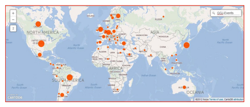
Figure 1 –2 013 GGJ hosts around the world.

The analysis of participants profile reflects the spirit of the initiative returning a structured composition of users and is able to detect the segmentation of jammers, for origin, gender, training and experience. Data say that the jam is still characterized by a predominance of men and young people. Women (Bryce, Rutter, 2003) still constitute only 12.6% of the total. If we put together the first two age groups 18–20 (23.9%) and 21–29 (56.5%), we get over 80% of the participants, even though 15.5% of the 30–39 class shows that video games are not "kids stuff".