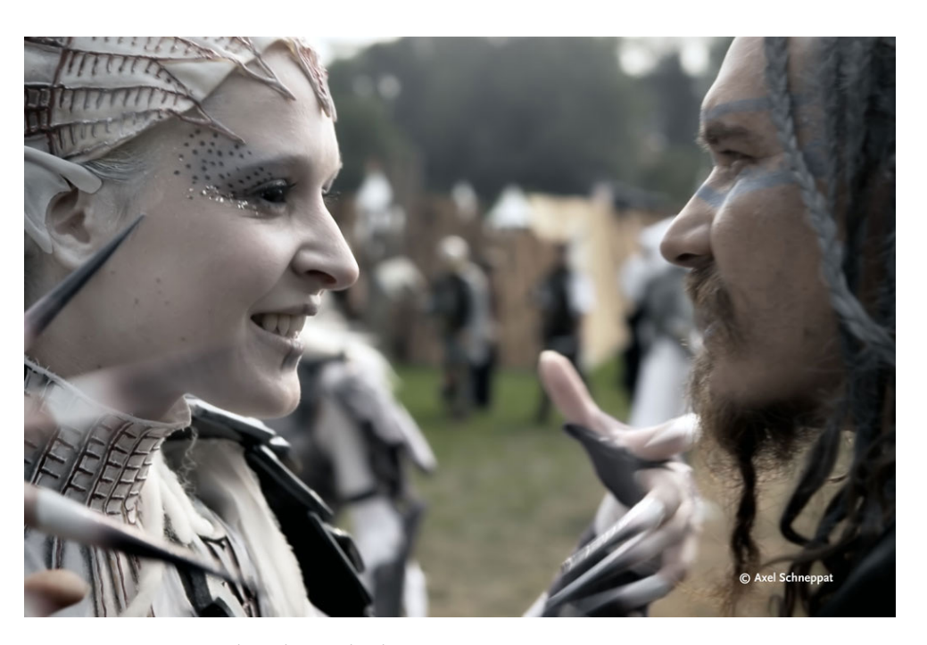
Figure 1 – LAR Pers.

This article is about structural resemblances, linguistic and rhetoric similarities and a joint set of tactical operations, that today's Nordic LAR Pers and 20th century avant-garde artists have in common. The proposition made here is not based on the genealogical assumption of one subculture having developed out of another subculture. What we want to point out here is rather that there is a distant resonance of structure, language and politics in between two movements that happened in different centuries and at different locations. The methodology used here can therefore not rely on spatio-temporal, historical consistency, but needs to compare the aesthetics of different subcultural movements. Such a comparison has to start on surface level and look at wordings rather than at words and their meaning. Such a comparison will also initially look at dress codes and not at a "system of fashion" (Barthes 1967) or an alleged "meaning of style" (Hebdige 1979). We hope however to be able to hint at a vicinity of attitudes, ideas and values that help detect relations beyond the borders of countries and centuries.