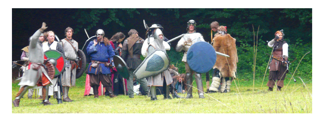
Figure 3. Picture made by the Nuremberg-Kulmbach-Connection, 20. September 2008, Author: NKC.

The energy is therefore constructed vis-à-vis symbolic power (Bourdieu, 1993) of a strong opponent. For "Controlled Invasion" the enemy was traditional game design, for Nordic Larpers it is the Anglo-American gaming industry. "The supreme demonstrations of the weaknesses of conventional LARP are the commercial products of the Anglo-American gaming industry. By aiming at a lowest common denominator, these publications achieve nothing beyond the infant stage"11. Strong language is indicative of subcultural rhetorics. As long as the verbally uttered disrespect targets just another subculture there is no reason to perceive the rebellious group as countercultural (Turner 2006). Countercultural action is characterized by a profound opposition to the values of a broader societal segment – and not just by disapproval or a specific subculture's canon of music, fashion and life-style. Insofar the statement of "Fuck the magic circle" can hardly be seen as a countercultural exclamation. Society as a whole has hardly any issue with the concept of a magic circle. It is game studies scholars who cherish the notion and the "Controlled Invasion" invaded or tried to invade just another subculture and nothing more.