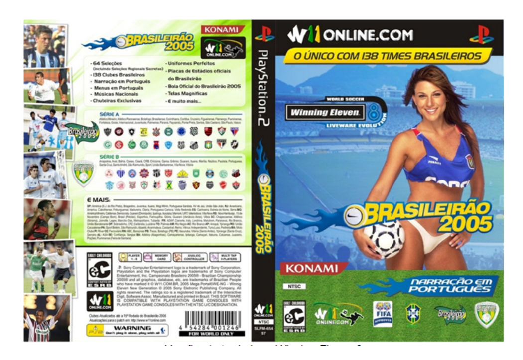
Figure 6: Pirated version of the game Winning Eleven 8.

However, the possibility of digital distribution and the ease of finding products have allowed the free replication to be a common phenomenon, even when most of the times those products are copyrighted. Chris Anderson (2008, p. 11) explains the economics of abundance: "what happens when the bottlenecks that stand between supply and demand in our culture start to disappear and everything becomes available to everyone". The author also defends that consumers are becoming active producers because of low costs and population of technology, removing the control of content off the big corporations. It is a time when games made by fangames and mods are easily available to the mass of niches. Therefore, Brazil continues the products' customization in the 21th century.